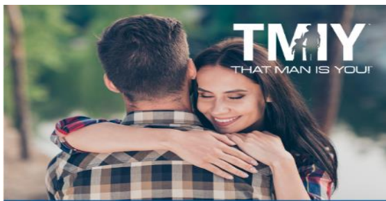
This fall – TMIY: The Battle Over the Bride